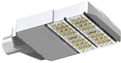
60W LED Street/Carpark light