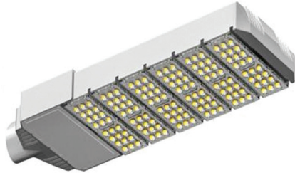
200W LED Street/Carpark light